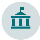
Capital. Model. Regions