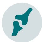
Orthopaedics and endoprosthesis