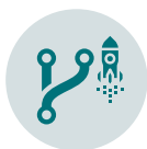
Spin-offs and start-ups