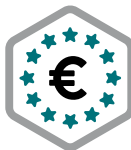
Leading Euro- pean location for venture capital