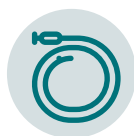
Minimally invasive medicine