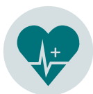
Cardiovascular medical technology

The life sciences in the capital region feature extraordinary strength in the following technologies and topics: