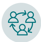
Networking and transfer