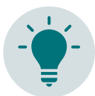
Innovation and technologies