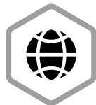
Appealing to skilled interna- tional employees