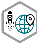
Top start-up location