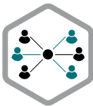
Effective stakeholder networking